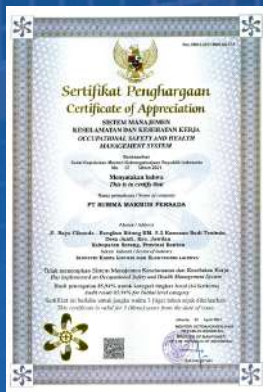
SMK3 Certificate Occupational Safety And Health Management System