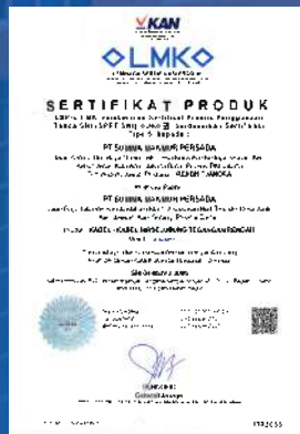
SNILMK Product Certification