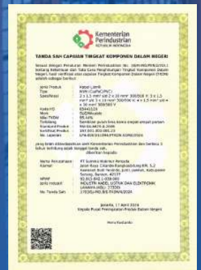
TKDN Local Content Certificate