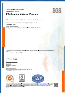
ISO 9001 : 2015 Certificate Quality Management System